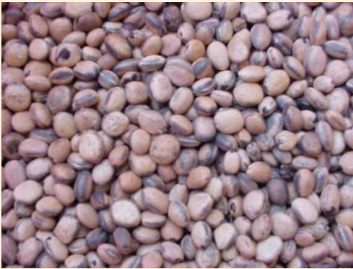
Cleaned African locust bean seeds