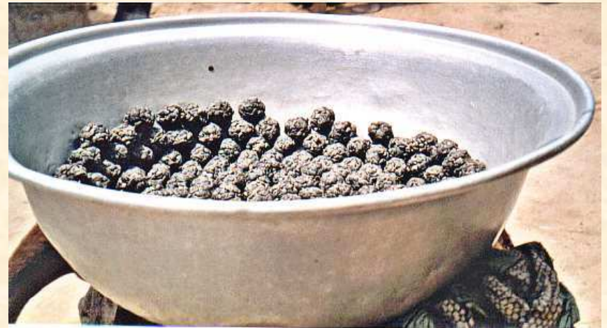
Dried balls of soubala