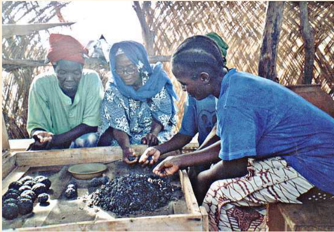
Moulding into balls