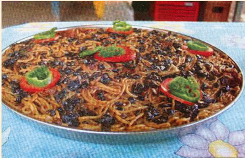
Pasta with Soubala