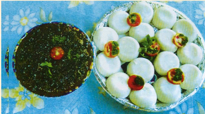
Soubala sauce with `to` ( thick maize porridge)