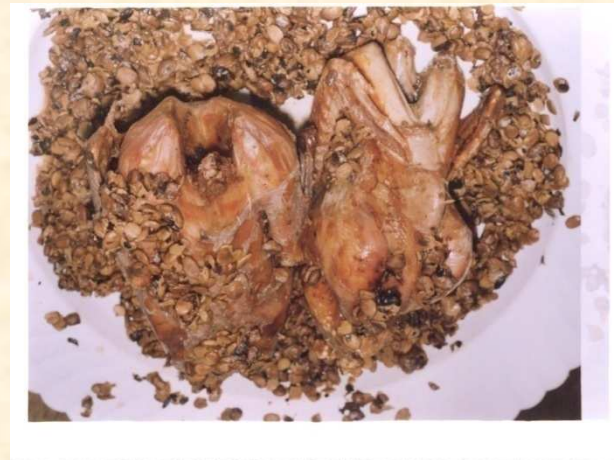
Guinea fowl with Soubala also called `Guinea fowl dish of mother in law`